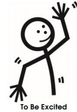
To Be Excited